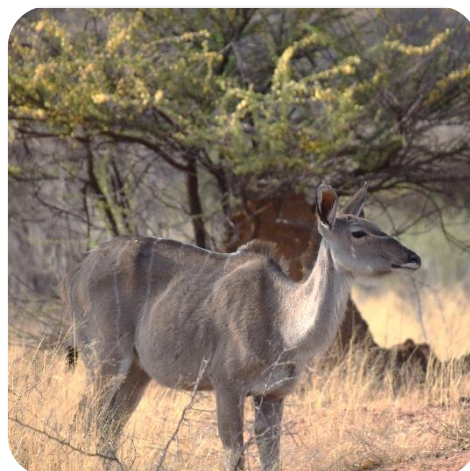
A Vachellia (Acacia) bush where you can clearly see the browse line. On the second photo you can see a thin kudu cow, with a 'full' belly.