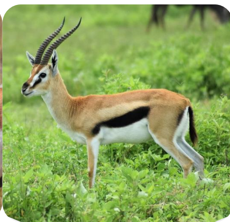
Left; springbuck ram in Etosha NP, Namibia. Right; Thomson gazelle ram in the Ngorongoro Crater, Tanzania.