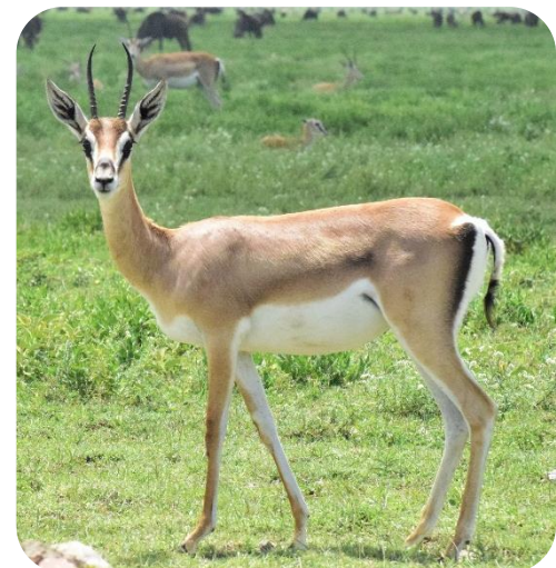
Grant gazelle ewe. Photo taken in the Ngorongoro Conservation Area in northern Tanzania

To see gazelles in Africa (there are also species in Asia and America), you would have to travel a bit more north or north-east, to for example Tanzania, Kenya, Sudan, the Sahel or the Sahara.