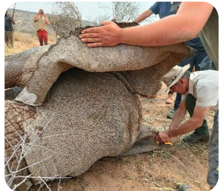
Tagging a black wildebeest, springbuck and elephant