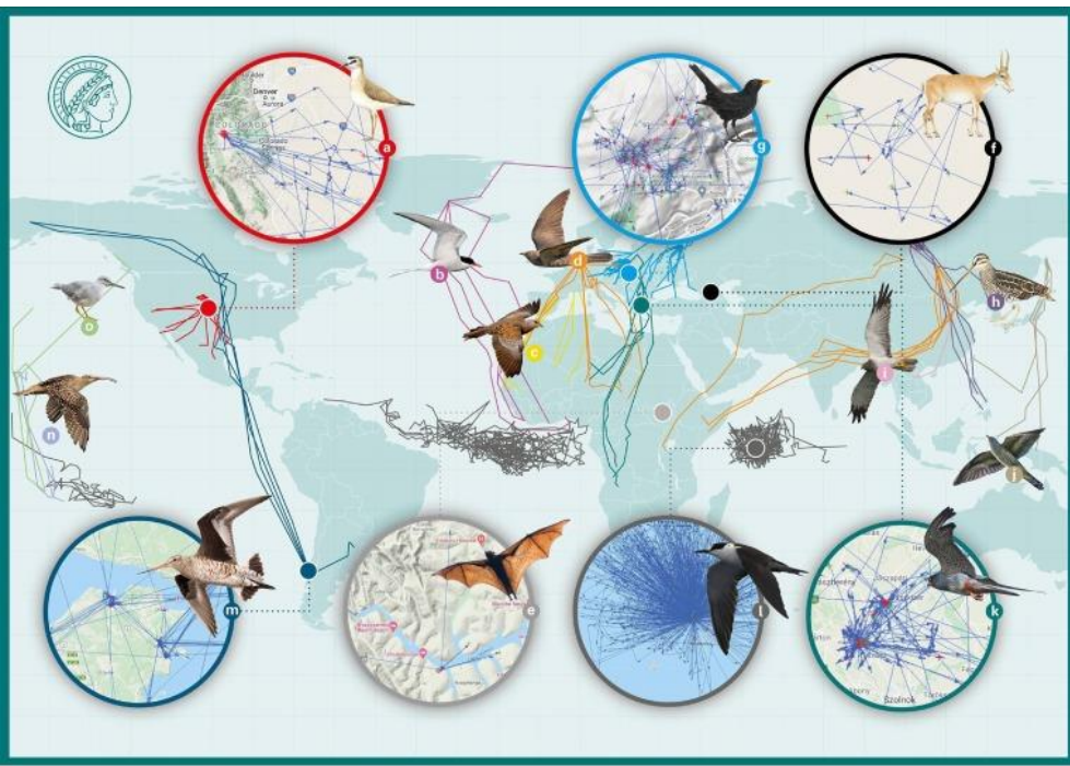
This picture shows animal movement data which was captured between 11 March to 03 November 2021

Tracking animals is not a new thing, but the ICARUS Initiative is taking animal tracking to the next level. The goal of ICARUS is to create a living map of the Earth's animals – this means tracking animals with a network of sensors (tags on the animals) that can send real-time data to space. Basically, an 'Internet of Animals' is created, that can tell researchers how ecosystems are changing real-time, and how animals respond to this.