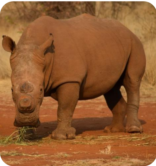
Rhino nibbling on the last straws of lucerne of the ground, thereby possibly ingesting sand as well

With the continuing drought and diminishing grazing, farmers are forced to supply their animals (livestock and game alike) with supplemental feeding. As the grazing deteriorates, animals are forced to graze down to ground level, which inadvertently leads to some sand ingestion.