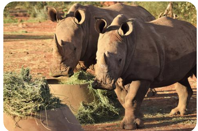
First picture: Conveyor belts or rubber mats underneath a hay stack reduces wastage, and prevents the ingestion of sand. Roans (middle) and rhinos (third picture) feeding from feeding bowls. When you use feeding bowls, always make sure you have enough bowls for all animals, and have enough space between each bowl.

Click here to read the full article ‘Sand Ingestion and Sand Impaction’, which is freely available on the Documents-section on our website