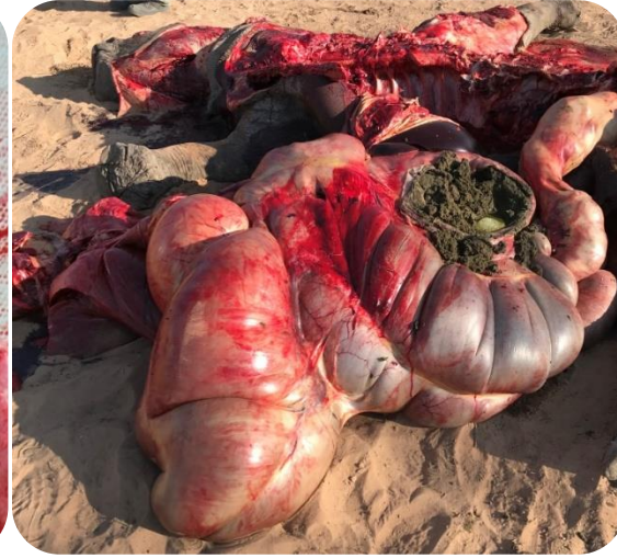
Left: Enlarged abomasum of a giraffe, filled with sand .