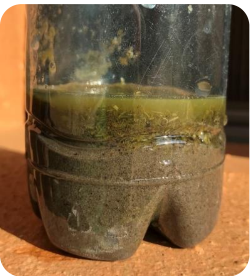
This is the colon content from a rhino shaken up in water. You can see the content is nearly 100% sand

It can be difficult to prove sand ingestion and sand impaction. An easy test you can do yourself is to collect some faeces, and put this in water (ratio faeces and water should be about equal). After a minute or two you can observe the sand sedimentation. Since sand is heavy, it will settle at the bottom, while the rest of the faecal matter will settle on top. Please note that this test is easy, but also unreliable! This test can be negative in animals suffering from severe sand impaction and it does not tell us how much sand has accumulated in the intestines.